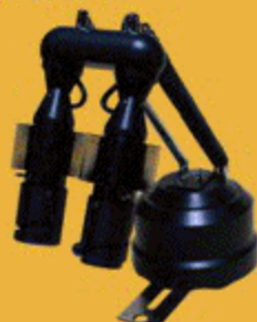
Excitation stand FBL/Basic-B&N-01