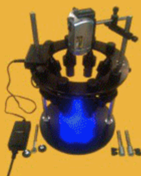
Camera/Video Stand CVS 8