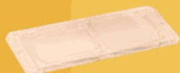
MG - 18; MG - 23; MG - 27