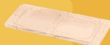
MG - 18; MG - 23; MG - 27